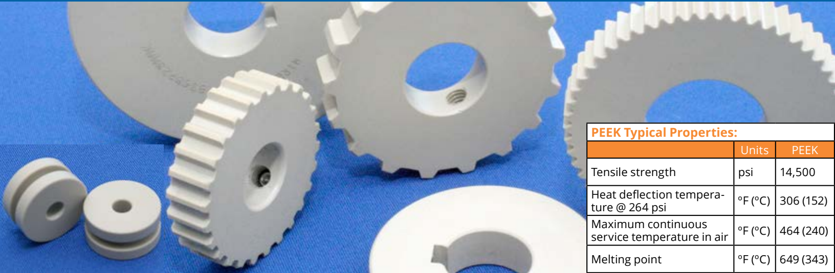
PEEK Typical Properties:

The Trusted Metal Conveyor Belt Manufacturer